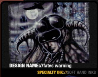
DESIGN NAME://fates warning SPECIALTY INK://SOFT HAND INKS