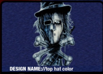
DESIGN NAME://top hat color