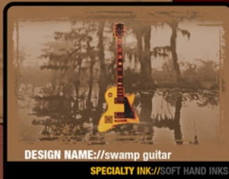
DESIGN NAME://swamp guitar SPECIALTY INK://SOFT HAND INKS