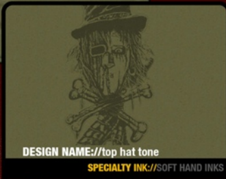
DESIGN NAME://top hat tone SPECIALTY INK://SOFT HAND INKS